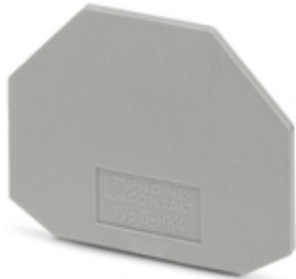
End cover, length: 54 mm, width: 2.3 mm, height: 41.5 mm, color: gray

Please be informed that the data shown in this PDF Document is generated from our Online Catalog. Please find the complete data in the user's documentation. Our General Terms of Use for Downloads are valid ( http://phoenixcontact.com/download )